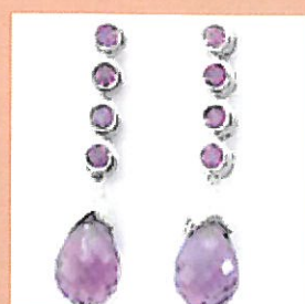
659425 • £95.75 5.76ct Amethyst Briolette Drop