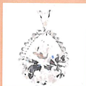
653191 • £32.00 Diamonique 15.78ct TW Grand