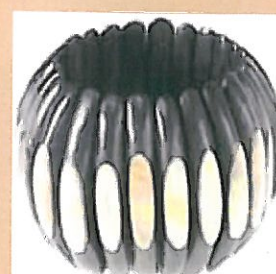
329956 • £16.00 Lee Sands Wood & Shell Chunky 18cm Bracelet