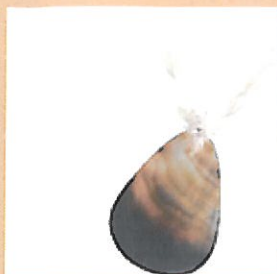
661815 • £43.40 Gem Statements Serpentine Bead & Shell Drop Necklace 45cm Sterling Silver QVC Price £47.75

Set to be this summer's hottest look, boho style incorporates an eclectic mix of colours and patterns - which means the jewellery you wear with it needs to be bold and confident enough to hold its own. So forget subtlety - go for pieces that make a statement. Pile on the beads, bangles and chandelier earrings for a fashionably free-spirited look!