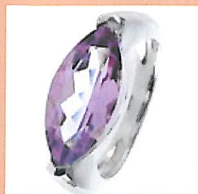
661145 • £23.86 3ct Brazil Amethyst Marquise Cut

Clever cutting can really enhance the beauty of a gemstone. These glittering pieces feature stunning multi-faceted pear-cut, briolette-cut and marquise-cut stones, expertly designed to reflect the light in a myriad of tiny windows. After all, a girl can never have too much sparkle!