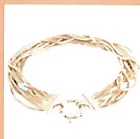
658624 • from £138.00 9ct Gold 18cm 9 Strand Glamour Bracelet, 11.9g QVC Price from £152.00