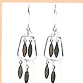
662779 • £21.59 9ct Gold Chandelier Millegrain Frame Earrings QVC Price £23.75