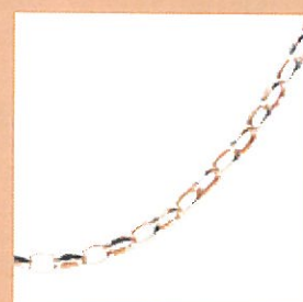
657994 • £76.44 9ct Gold 100cm (39.4") Cento Belcher Chain 8.1g QVC Price £84.00